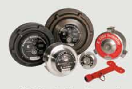
FDC Protection Products

For residential use only, it holds a maximum of two keys. The residential key box provides entry for fire and medical emergencies on residences – single family homes and apartment complexes. It can be mounted permanently near the door or directly on the door or if the key box is needed only temporarily, it is available with a temporary door hanger. Options include a lift off door and a hinged door.