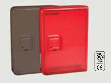
Knox Elevator Lobby Box