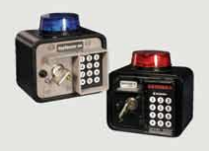
Master Key Retention