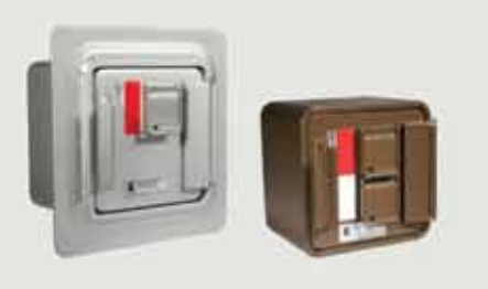
Knox-Vault® 4100 Series