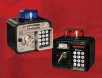
Master Key Retention